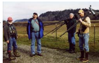
NRNC Volunteers at estuary restoration monitoring site

NRNC is currently working with the Nisqually Tribe and Nisqually National Wildlife Refuge on a monitoring project in the eastern portion of the Nisqually River Delta. Following a summer 2002 dike breach on tribal lands, Nature Center volunteers have performed monthly bird surveys to record bird use of the resulting mudflat habitat. We plan to continue monitoring changes in species diversity on the site during the next several years as the habitat succession occurs.