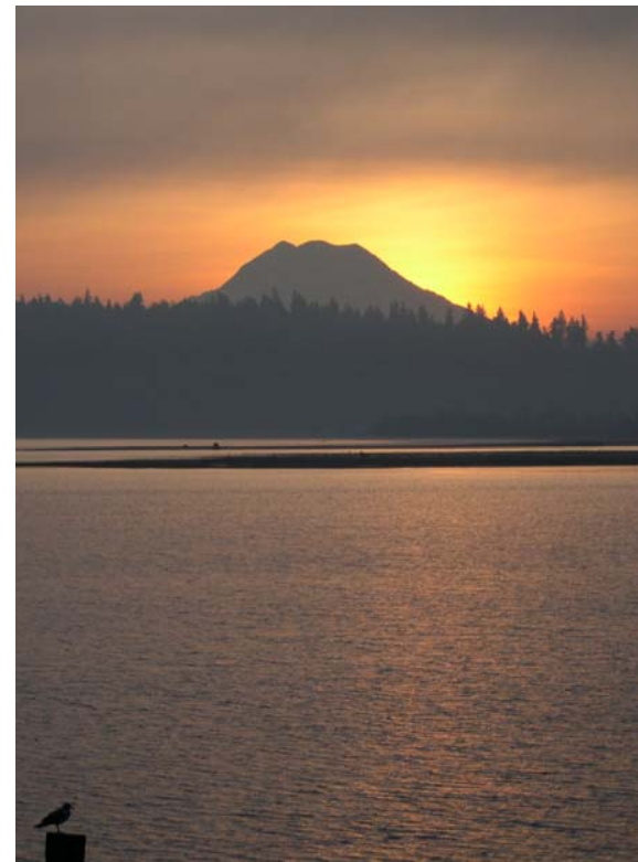
Mt. Rainer at sunrise over the Nisqually Estuary.