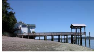
NRNC building and dock at low tide

Nisqually Reach Nature Center (NRNC) is a volunteer-run, membership-supported, non-profit organization that promotes the understanding, appreciation, and preservation of the Nisqually estuarine ecosystem and its integral role in the local environment, history, and culture