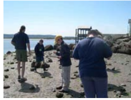
Students on the beach