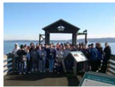
Keithley Middle school class

NRNC is fully committed to its mission of resource education in the South Sound and has many different programs designed to do just that. Most of our programs work to combine ongoing science principles into our education curriculum.